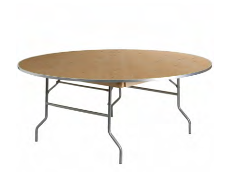
66"Round Banquet Table: $16.00