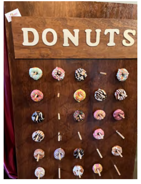
6' Tall Donut Wall. Fits 50 Donuts. (Must be placed on floor): $125.00