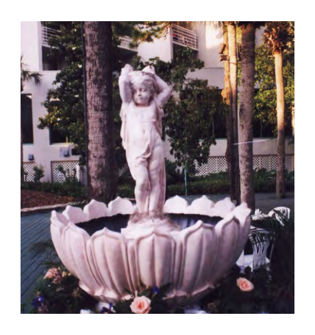
Cherub and Lotus Fountains: $450.00, plus labor.