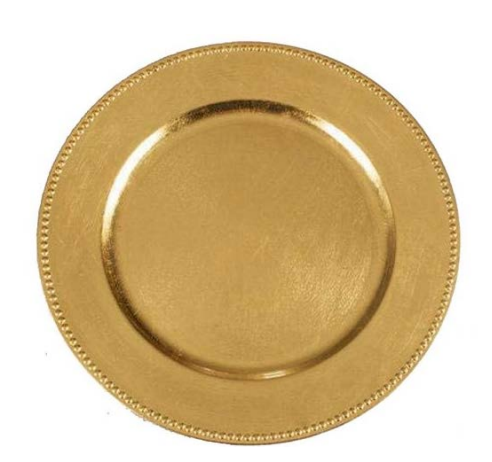
Gold/Silver Chargers: $2.25 ea.