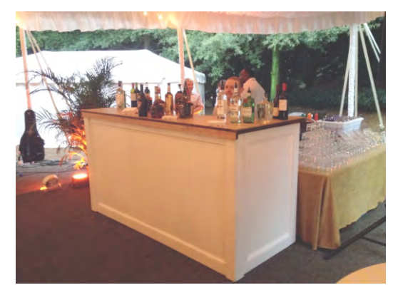
6' Cappuccino and White Bar Surround: $200.00