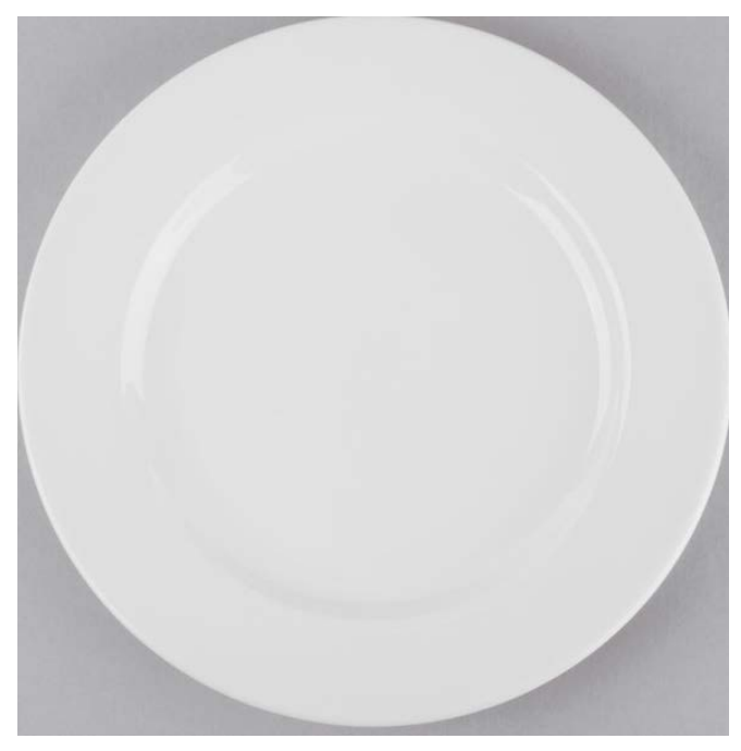
White Plate- $1.00 ea. Available in: Soup Bowl, Dinner Plate, B&B Plate