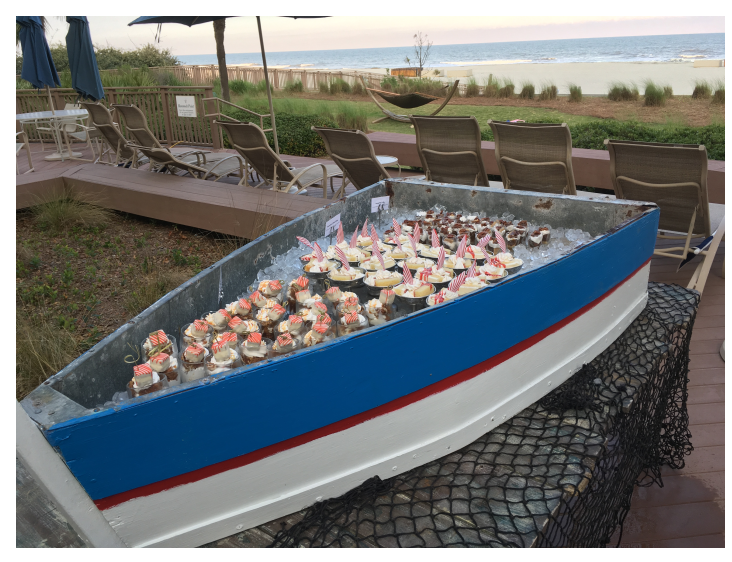
Nautical Boat Buffet: $125.00