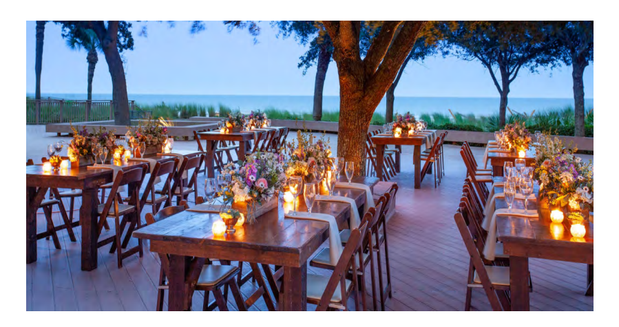
40" x 96" Americana Brown Farm Table (benches and chairs additional): $120.00