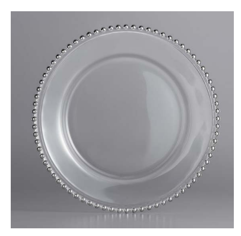
Glass Beaded: $6.25 ea.