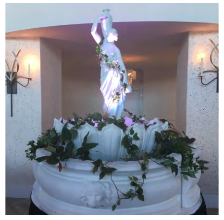
Water Bearer Fountain: $1250.00, plus labor. (FloralAdditional)