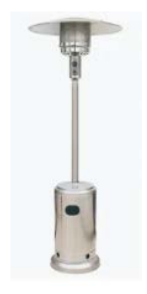
Patio Heater w/Propane: $75.00