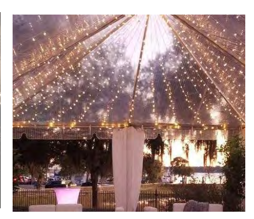
Edison Café Lights Café Lights Tivoli (tiny bulb) Lighting