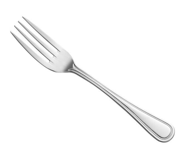
Standard Flatware: $6.00/per 10 pieces Available in: Dinner Fork, Salad Fork, Dinner Knife, Steak Knife, Teaspoon, Soup Spoon