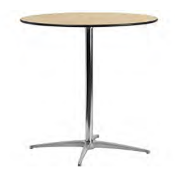
Cocktail Table: 30'' Tall x 30'' or 36'' Diameter: $11.0030'' or 36''