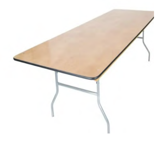
6' x 30" x 30" Banquet Table: $12.00 8' x 30" x 30" Banquet Table: $14.00 8' x 48" King's Table: $25.00