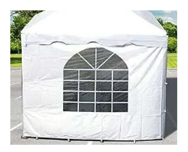
Cathedral Sidewalling Entire Tent: $800.00 (custom pricing for portions)