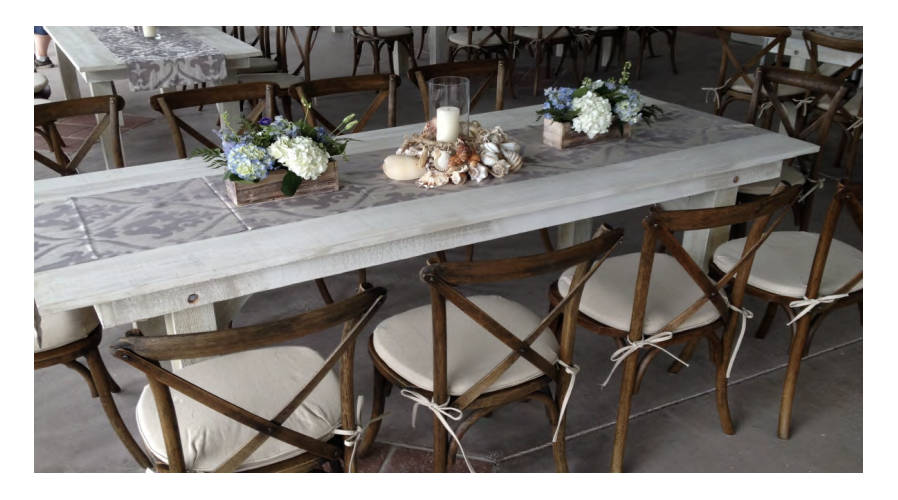
40"\,x\,96" White Farm Table (benches and chairs additional): $120.00