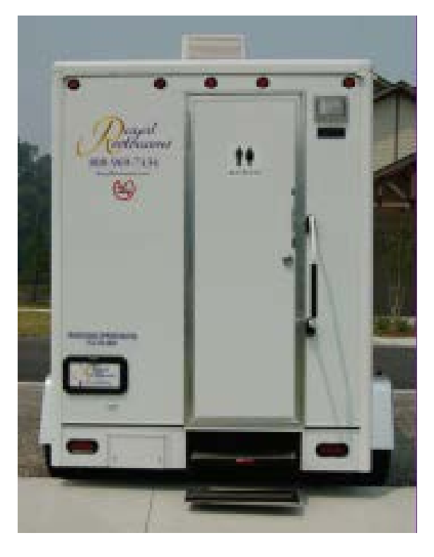
Single Stall Unisex Bathroom: $950.00 (Required for over 50-99 guests)