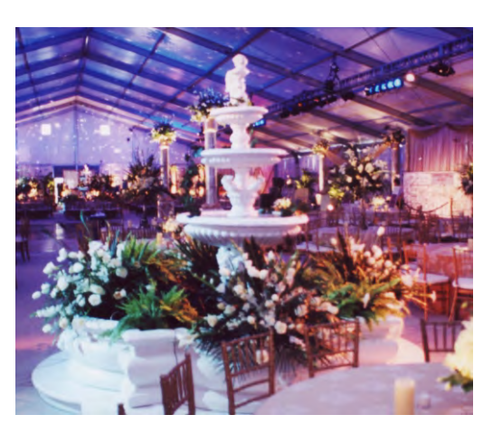
Large, 3-Tiered Fountain: $2250.00, plus labor. (Floral Additional)