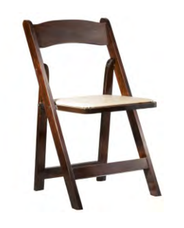
Padded Folding, Fruitwood: $4.00 (+$2.00 installation)