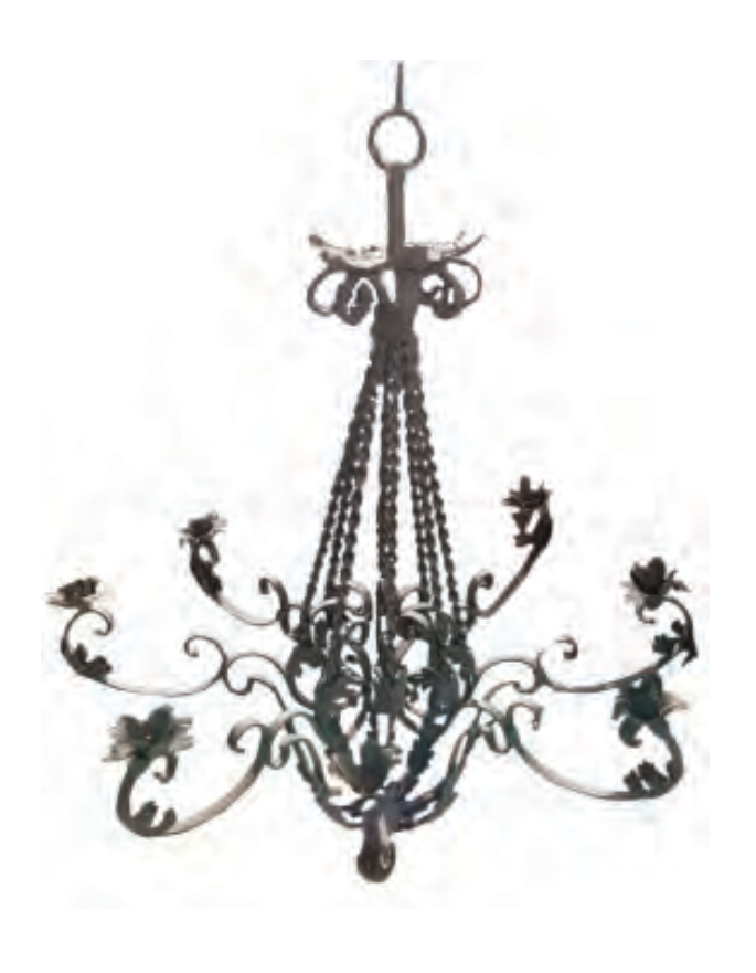
Wrought Iron Chandelier: $250.00 (Candlesby florist)