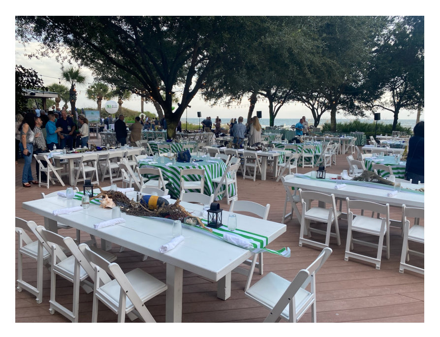
40" x 96" Americana White-washed Farm Table (benches and chairs additional): $120.00