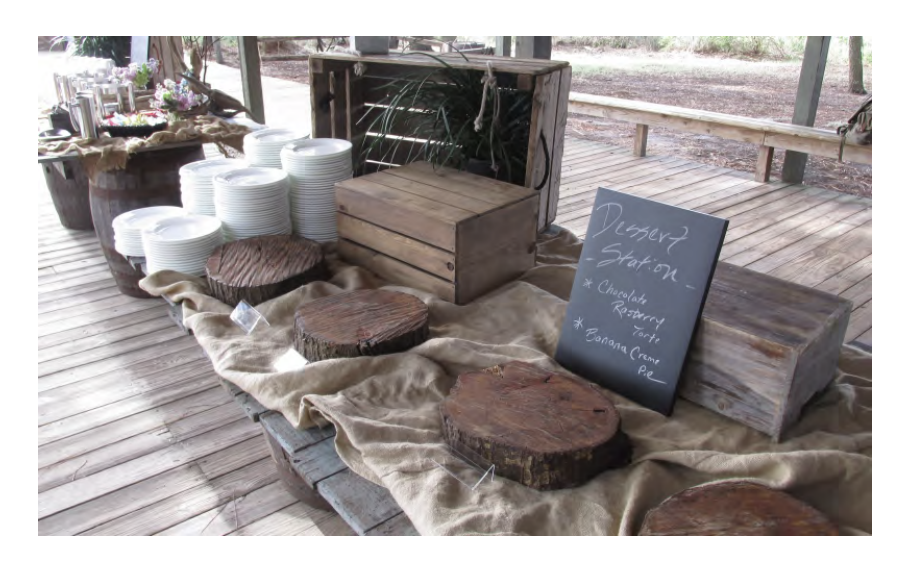
8' Rustic Wood Plank Buffet: $100.00