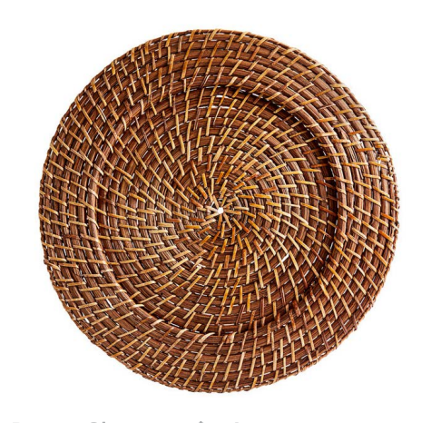
Rattan Chargers: $5.25 ea.