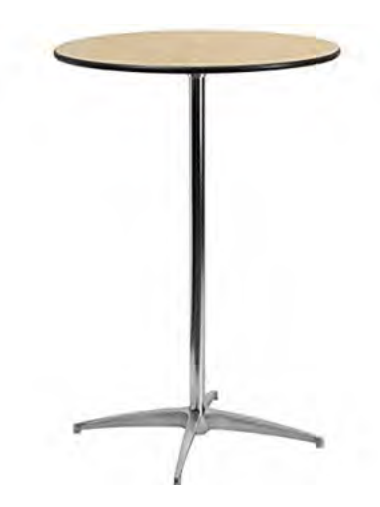
High Boy Table: 40" Tall, 30" or 36" Diameter Cocktail: $12.00