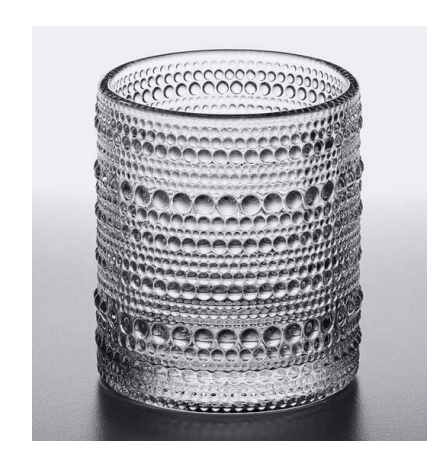
Beaded Rocks 10oz.: $2.25 ea.