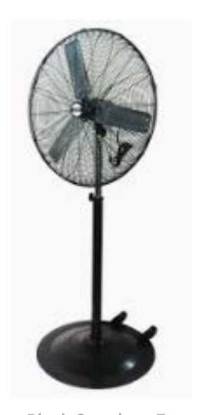
Black Stand-up Fan: $75.00 ea. (4 available)