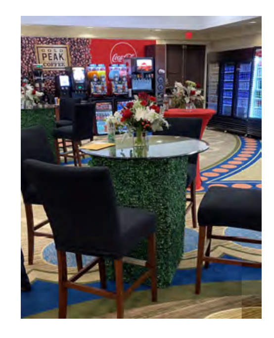
Boxwood Greenery Table: $75.00