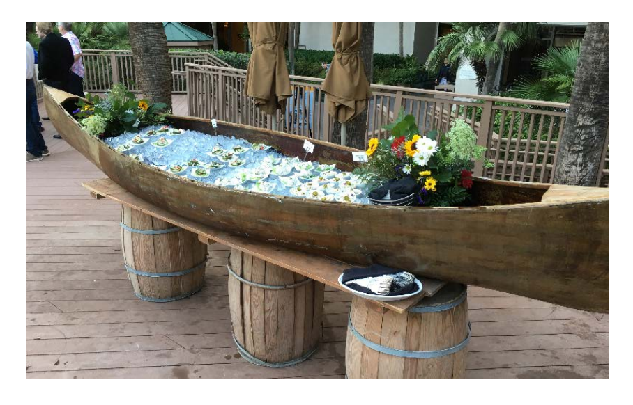
Canoe Buffet w/3 Barrels: $225.00/Canoe Alone: $125.00