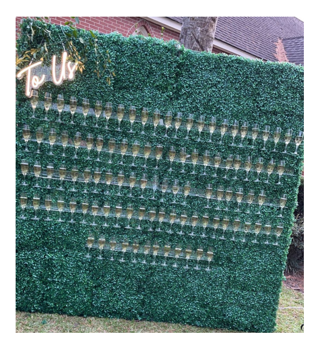
4' x 8' Sections of Boxwood Wall, $35.00 per section with shelving attached. 45 Glasses per section, plus $100.00 set up/$100.00 take down. Clear acrylic for champagne flutes: $75.00. Add $75.00 to hang neon sign