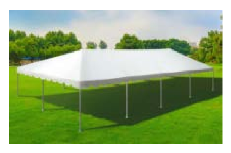
30 x 60 Standard Gable Tent (fits up to 100 sitting): $1200.00