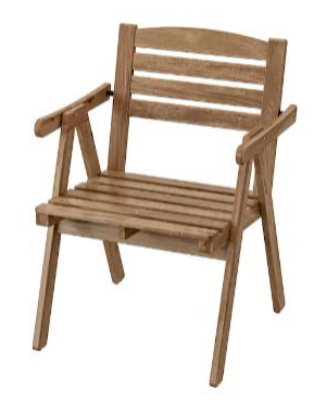
Slated Wood Chair: $8.00 ea.