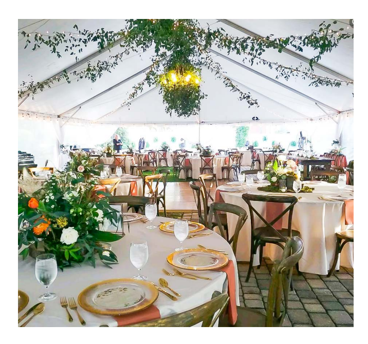
Overhead Greenery: Custom Quote