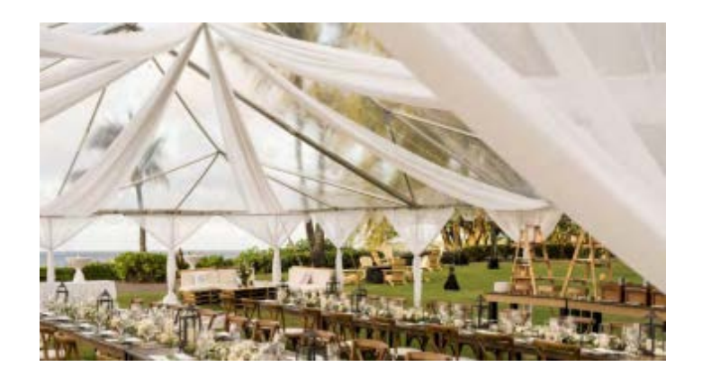
Overhead Draper: Custom Quote