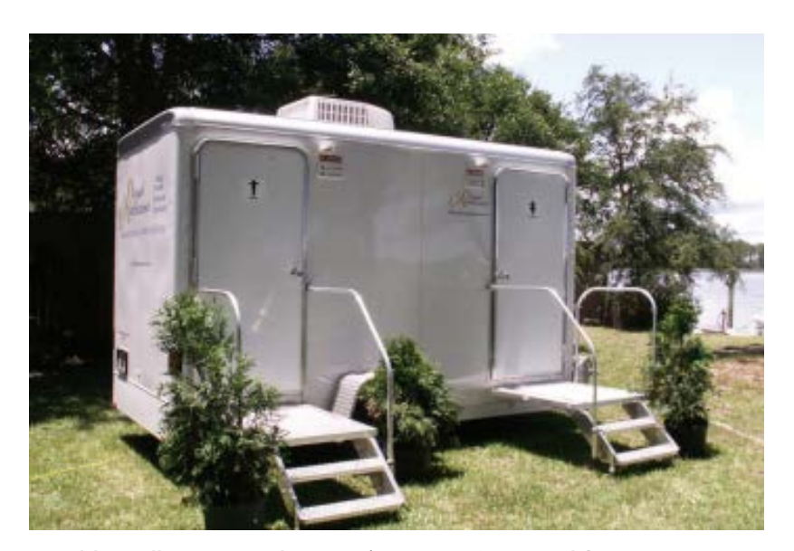
Double Stall Unisex Bathroom: $1150.00 (Required for over 100-149 guests)