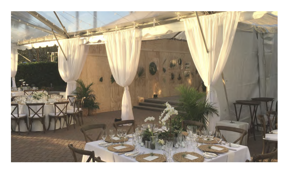
Draped Tent Poles: $85.00-$150.00 ea. (depending on size)