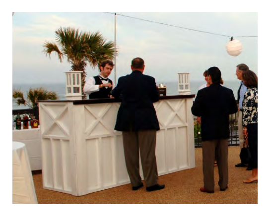
Crosshatch Bars & Surrounds:$250.00

LINENS Premier Linens - Basic Polyester - Custom Quotes, Depending on Availability, Sizing and Quantities