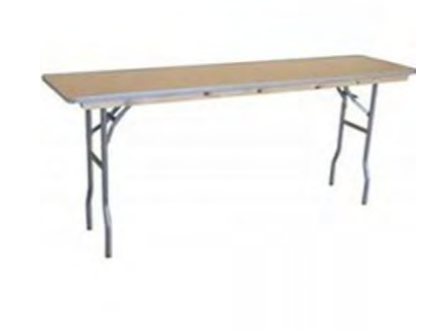
Conference Table: 8' x 18": $14.00