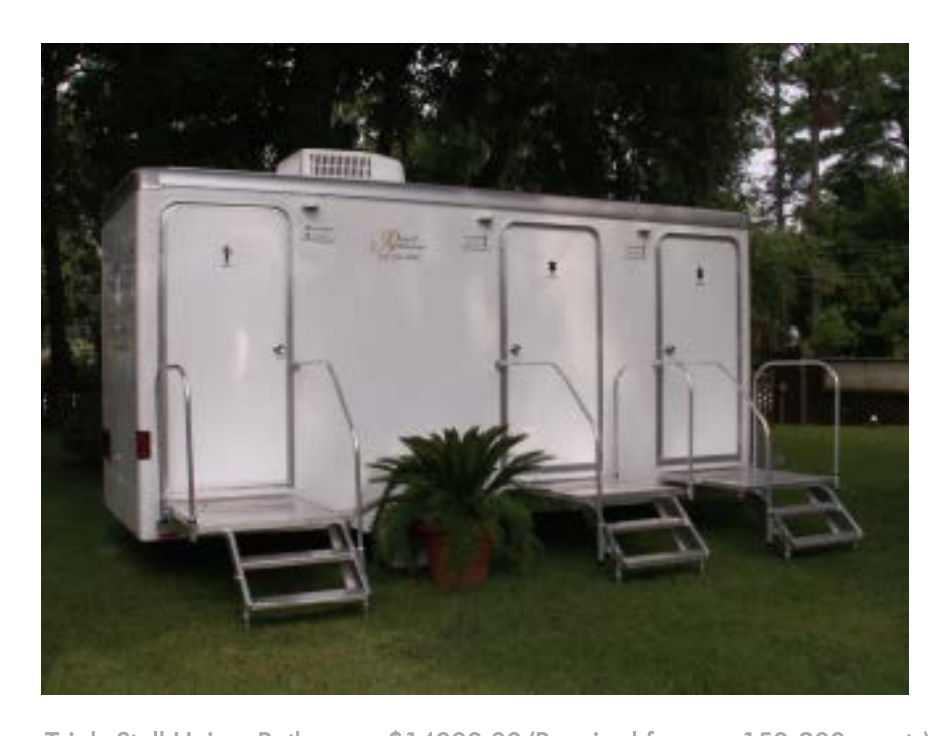
Triple Stall Unisex Bathroom: $14000.00 (Required for over 150-200 guests)